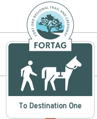
On-street Turn, Confirmation