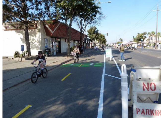
2017 Ciclovía Salinas - Open Streets Event

The vision statement for the plan is the foundation on which this Plan’s goals, policies and objectives are developed. To pursue this vision, this Plan emphasizes planning, designing and building bicycle and pedestrian facilities that will be used by a broad range of people throughout Monterey County.