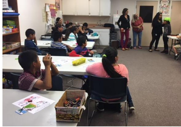
Bike Safety Event at King City Public Library

This goal emphasizes the importance of making investments throughout the County to improve multimodal connections in each part of our diverse geography. This goal is also aimed at ensuring that disadvantaged communities fully share in the benefits of active transportation programs and investments.