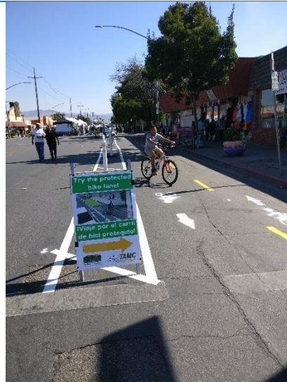
Demonstration Cycletrack 201 Ciclovía Salinas Open Streets

Having safer and more comfortable bicycle and pedestrian facilities encourages the use of active modes of transportation. Bicyclists and pedestrians are particularly vulnerable users of the street system. The innovative bicycle facility designs introduced in this Plan will enhance safety and increase predictability for bicyclists, pedestrians and all users of the road.