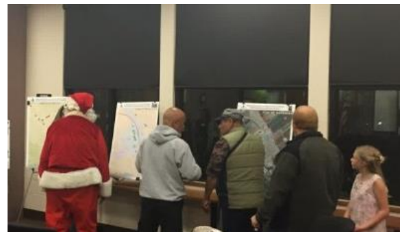
South County Workshop, December 2016

To develop the Active Transportation Plan, Agency staff consulted with TAMC's Bicycle and Pedestrian Facilities Advisory Committee, which is composed of volunteer representatives from each supervisorial district and city in Monterey County as well as representatives from public agencies and a bicycle/pedestrian interest group, as appointed by the TAMC Board of Directors, and TAMC's Technical Advisory Committee, composed of public works representatives from each of the twelve cities in Monterey County, Monterey County Public Works, Caltrans, Monterey-Salinas Transit, the Fort Ord Reuse Authority, the Monterey Bay Unified Air Pollution Control District, and the Association of Monterey Bay Area Governments.