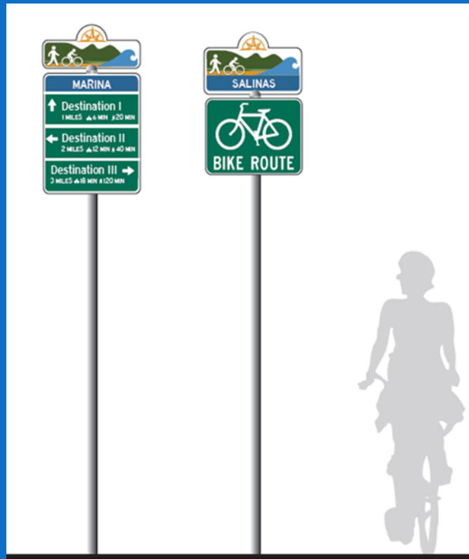
Sign designs from TAMC’s bicycle and pedestrian wayfinding sign plan

This plan analyzes opportunity areas for filling gaps and enhancing connectivity in the bicycle and pedestrian network in order to link key destinations within cities and in the region. This plan also recommends increasing the number of high quality support facilities, such as bicycle racks and lockers, and wayfinding signs.