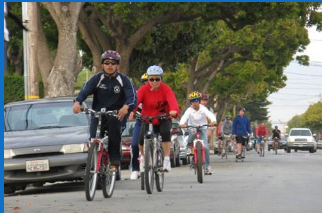
Bicyclists in Salinas during the 2009 Monterey County Bike Week

Encouraging more people to use active modes of transportation is the primary goal of this Plan. The Plan seeks to increase the total number of bicyclists and pedestrians in the County and the total percentage of all trips made by walking or using a bicycle. The goal is to increase the use of active transportation for commute trips, recreational trips and shorter distance trips, as well as trips to shopping centers, community centers, schools and when connecting to transit.