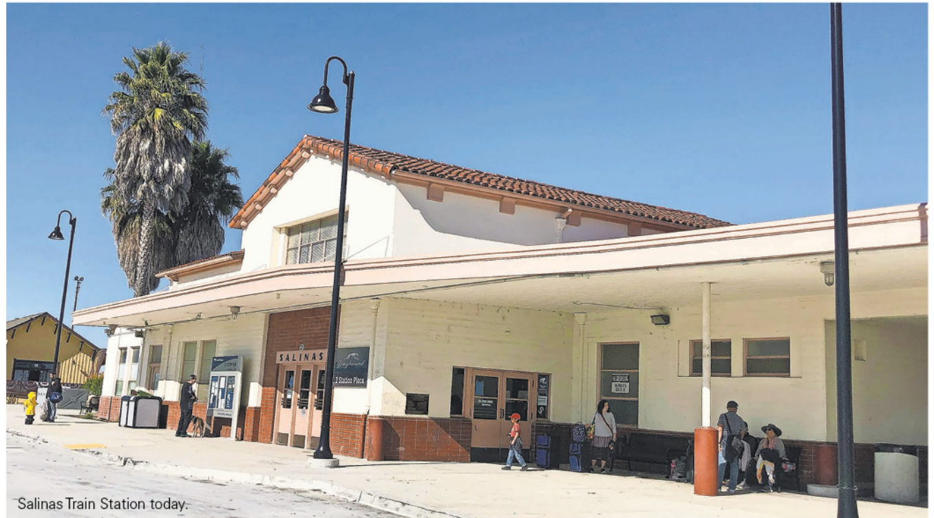
Salinas Train Station today.

Changes bring challenges; however, your Chamber of Commerce believes the Monterey County Rail Extension Project will help advance the Chamber's official vision of "a thriving, welcoming Salinas Valley where people, families and businesses succeed via economic growth and opportunity."