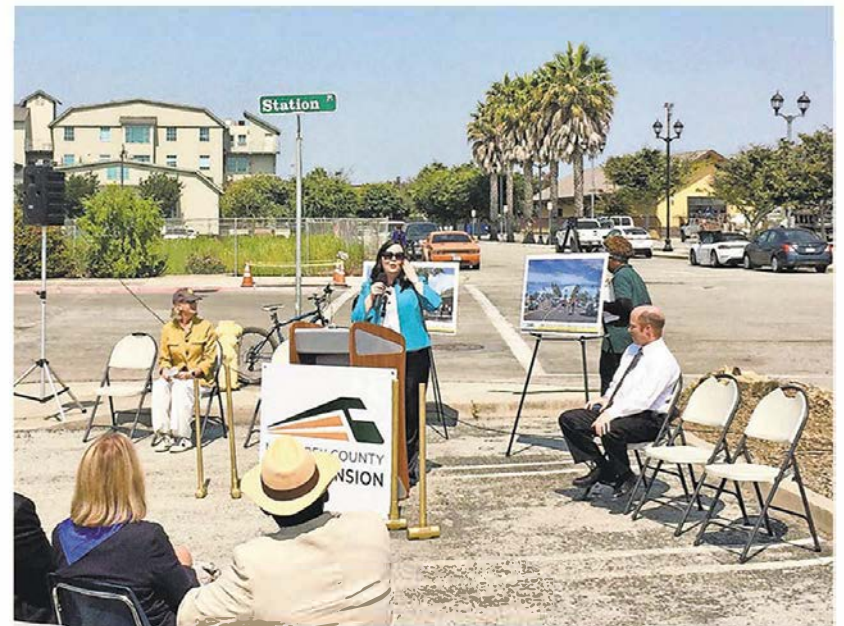
Kimbley Craig, then a Salinas City Councilmember and now Salinas Mayor, speaks at the groundbreaking for the Monterey County Rail Extension Project in August 2018.

The Transportation Agency for Monterey County (TAMC) is overseeing the long-term "Monterey County Rail Extension Project" in coordination with the City of Salinas, the City of Gilroy, Caltrain (the Peninsula/South Bay commuter rail system between San Francisco and Gilroy), Caltrans, the California State Transportation Agency (CalSTA), Union Pacific Railroad, and various public utilities such as Pacific Gas & Electric (PG&E), Monterey-Salinas Transit (MST) and the Salinas City Center Improvement Association