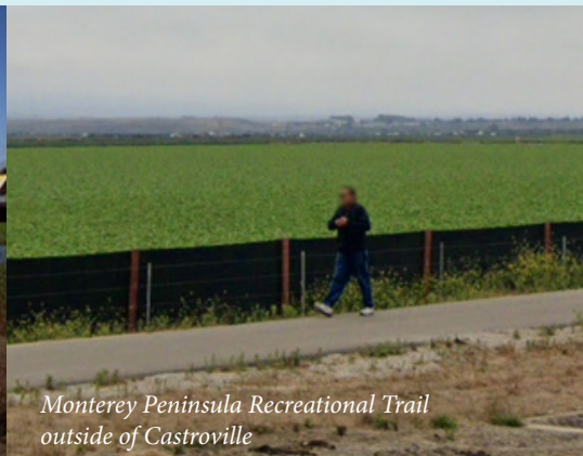
Monterey Peninsula Recreational Trail outside of Castroville