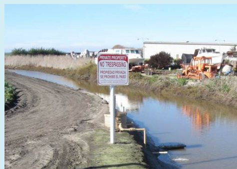
The Castroville community lacks public access to their neighboring waterbodies and coast.