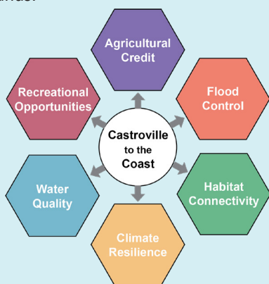
Multi-benefits of the Castroville to the Coast Project

Over the past few years, many community stakeholders have met to discuss surface water, open-space, and flood control needs and through that dialogue the “Castroville to the Coast” concept arose. The goal of Castroville to the Coast is to restore degraded waterways, improve water quality, reduce flooding, and provide a pedestrian and bike path between Castroville and the Coast. New state funding opportunities makes this project a great opportunity to invest in Castroville as an agricultural community in harmony with a well-managed system of creeks and wetlands.