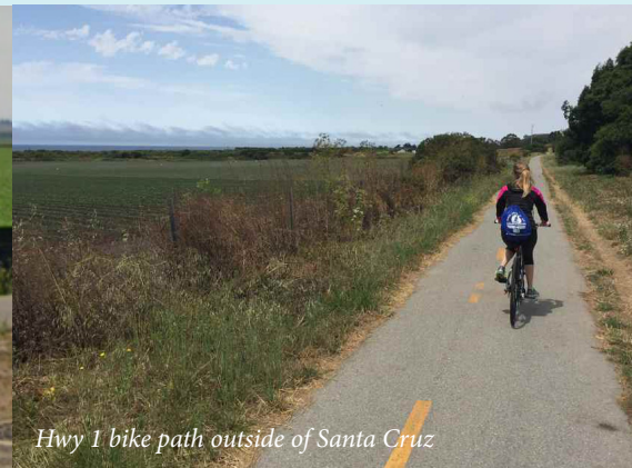
Hwy 1 bike path outside of Santa Cruz