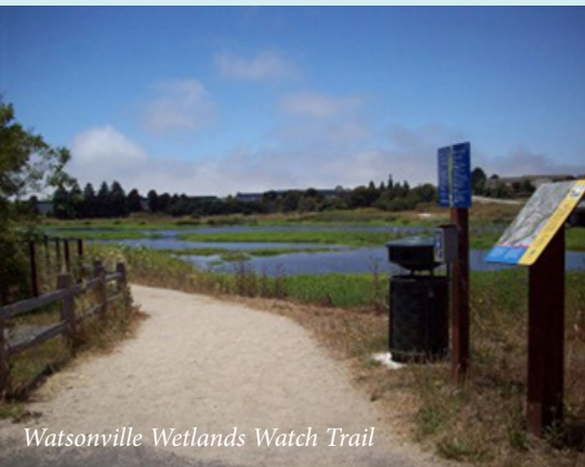
Watsonville Wetlands Watch Trail