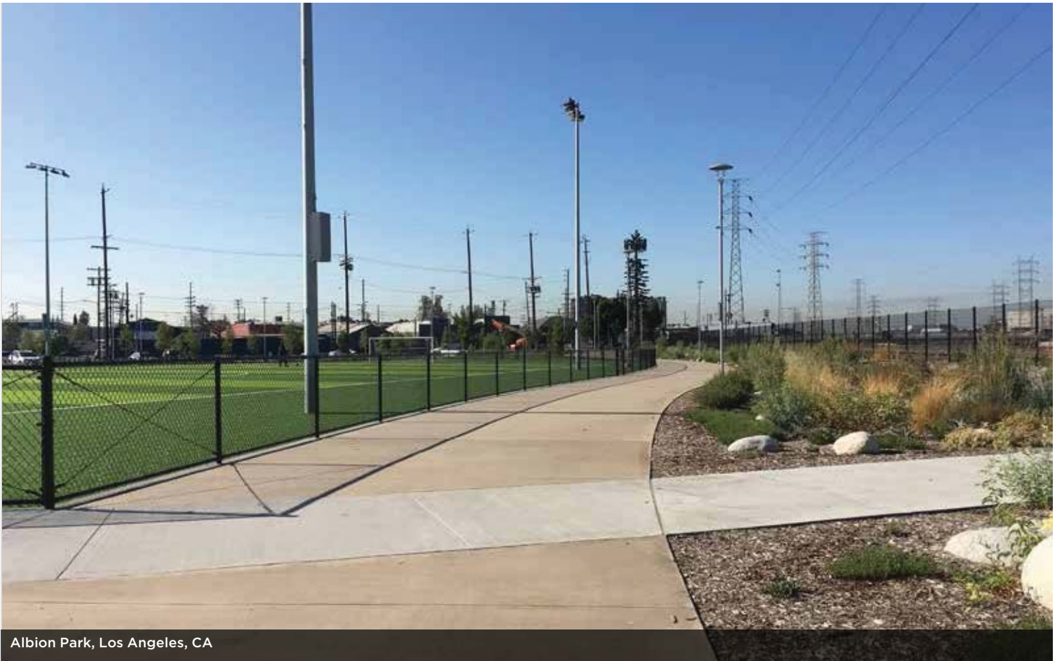
Albion Park, Los Angeles, CA