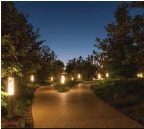
Tongva Park, Santa Monica, CA