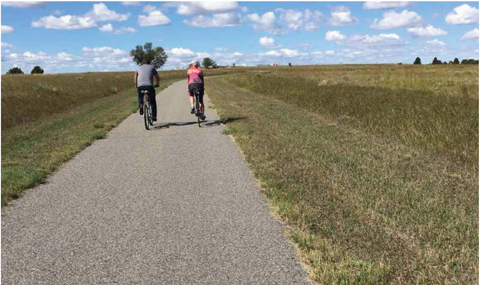
Heritage Trails, Billings, MT