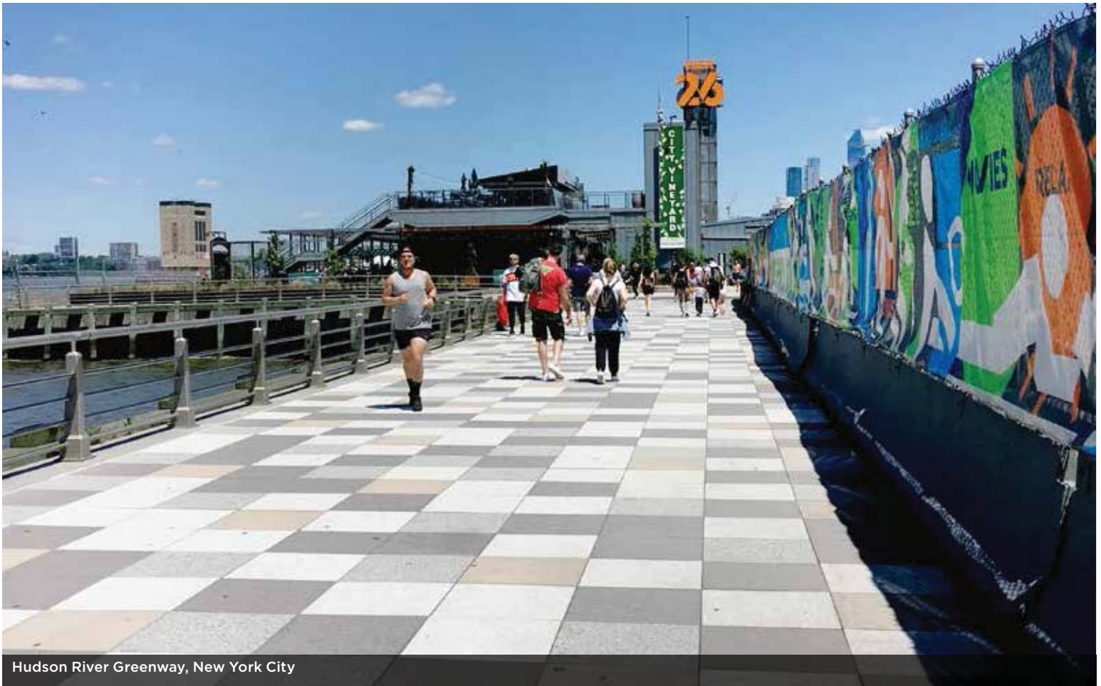
Hudson River Greenway, New York City