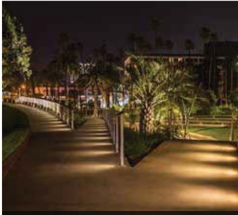
Tongva Park, Santa Monica, CA