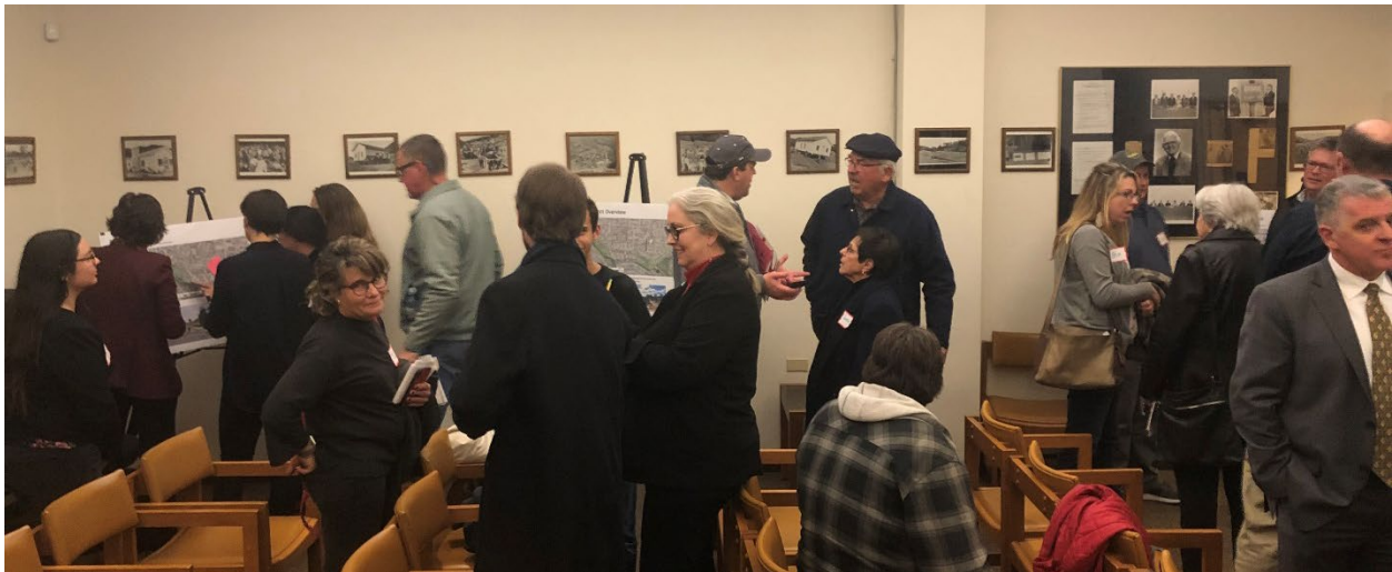
Figure 2: Workshop attendees visited open house-style stations