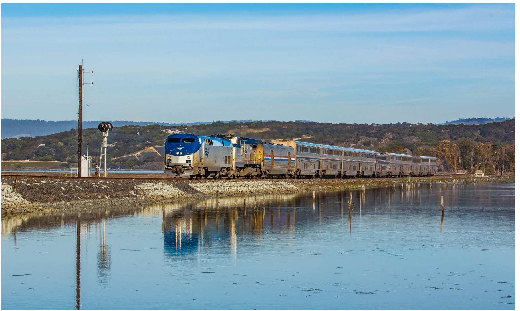
Southbound Starlight at Elkhorn Slough.