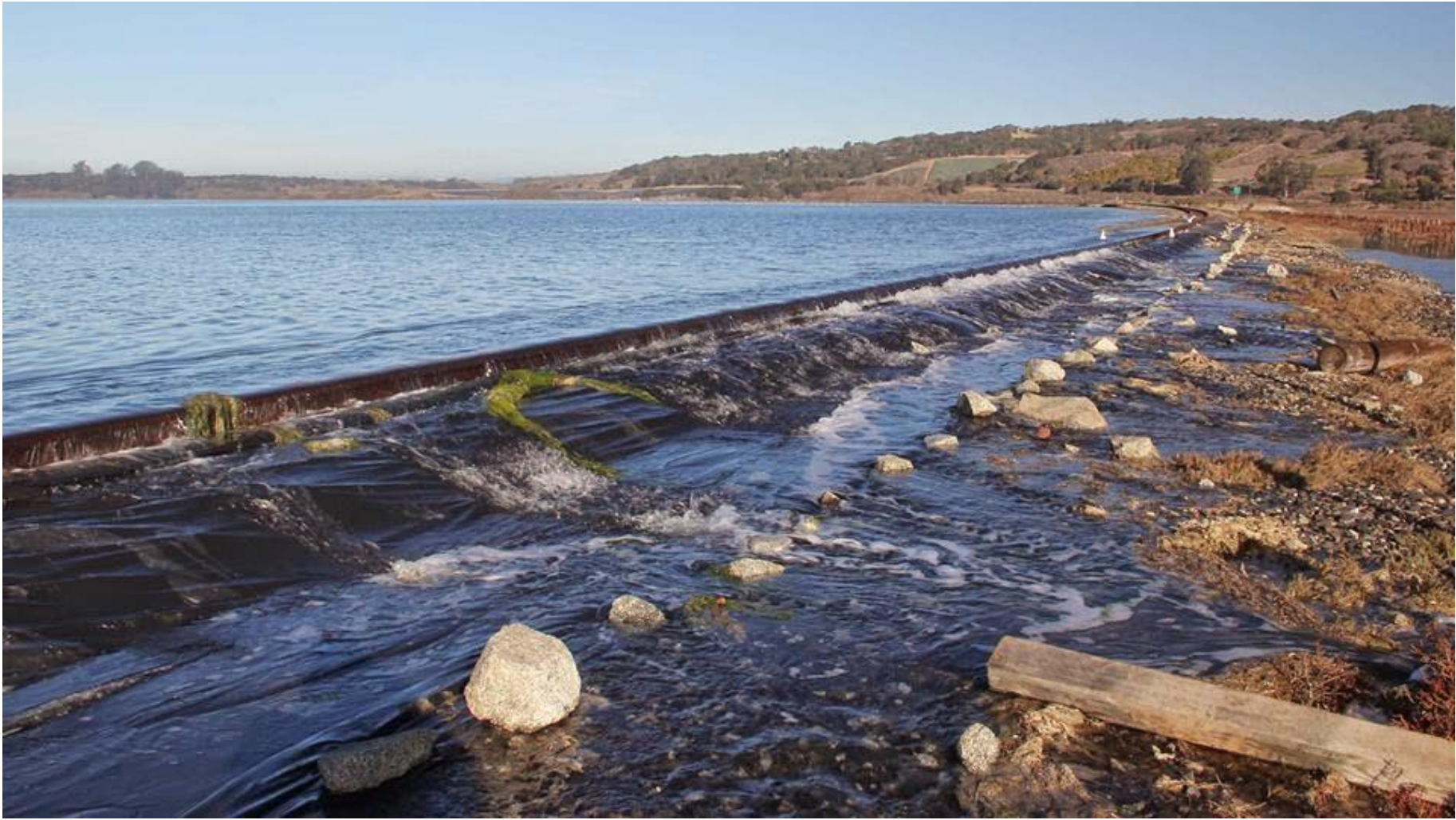
Rail Tracks Elkhorn Slough.