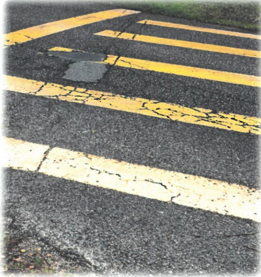
ROADWAY CONDITIONS BEFORE