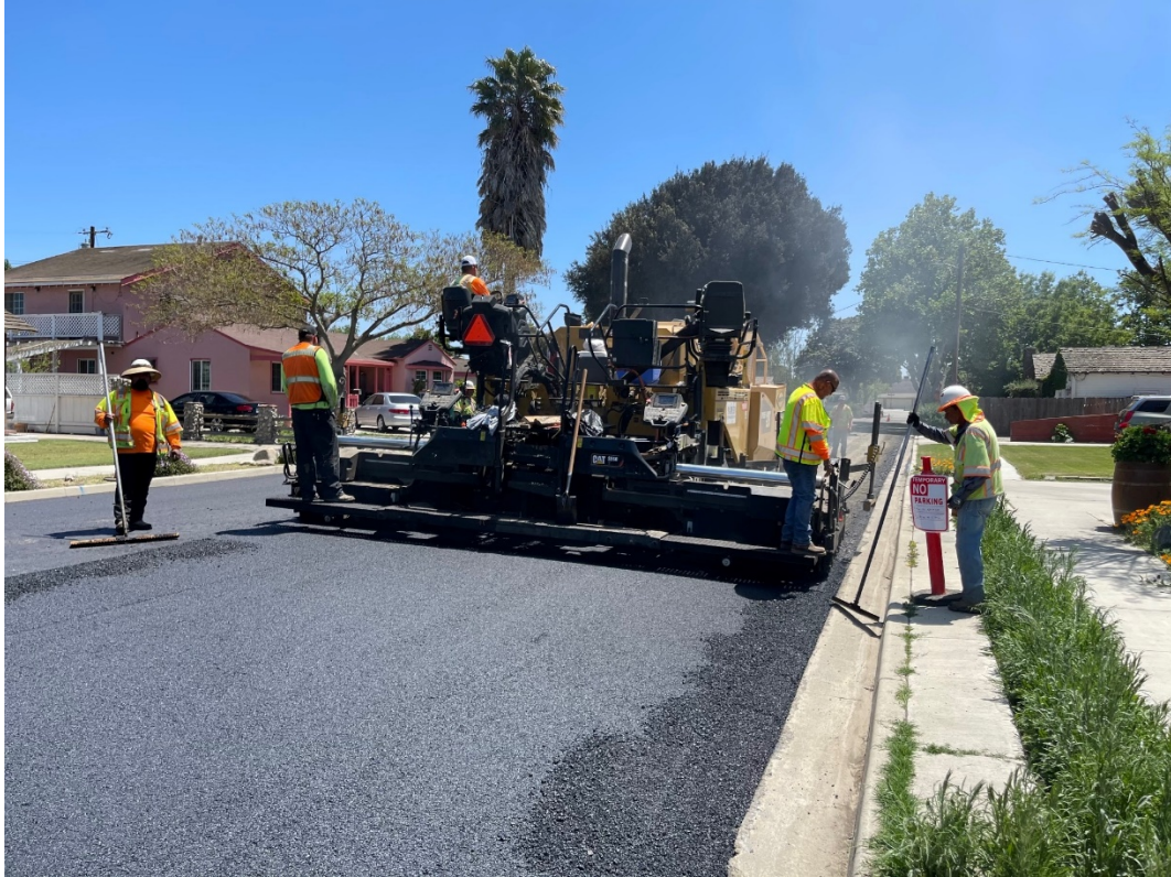
Figure 3 Patterson Street