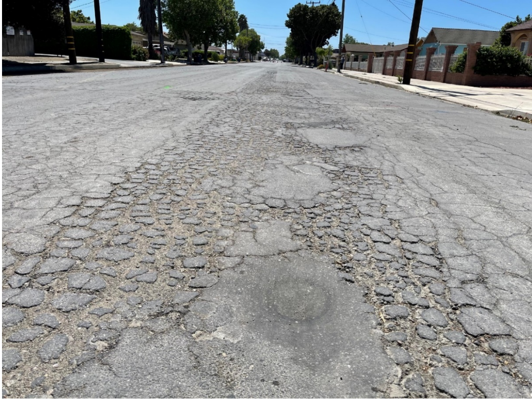
Figure 1 North Second Street