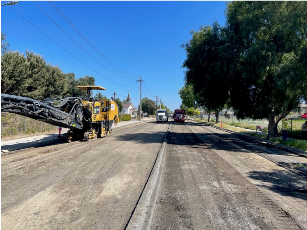
Figure 2 North Second Street