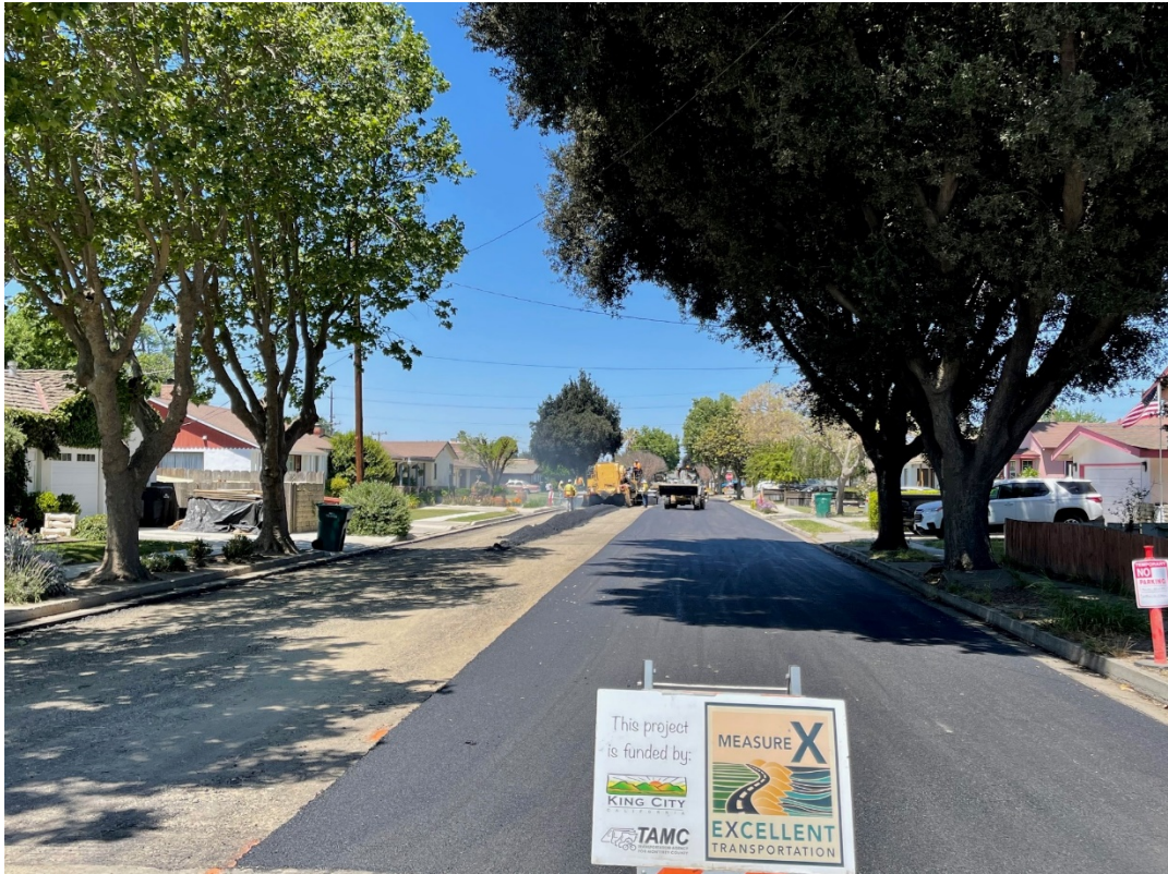
Figure 4 Patterson Street