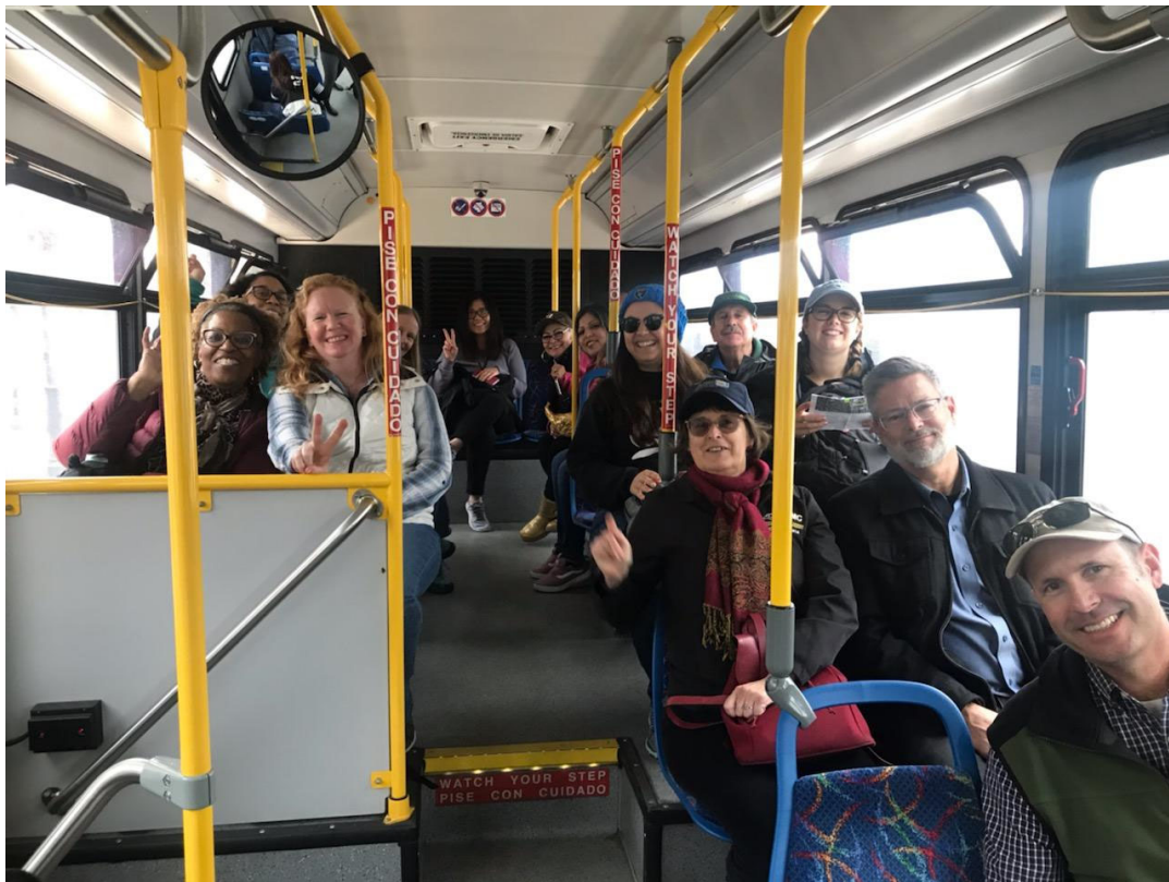
Team TAMC rides the bus

The Transportation Agency for Monterey County is an Equal Opportunity Employer.