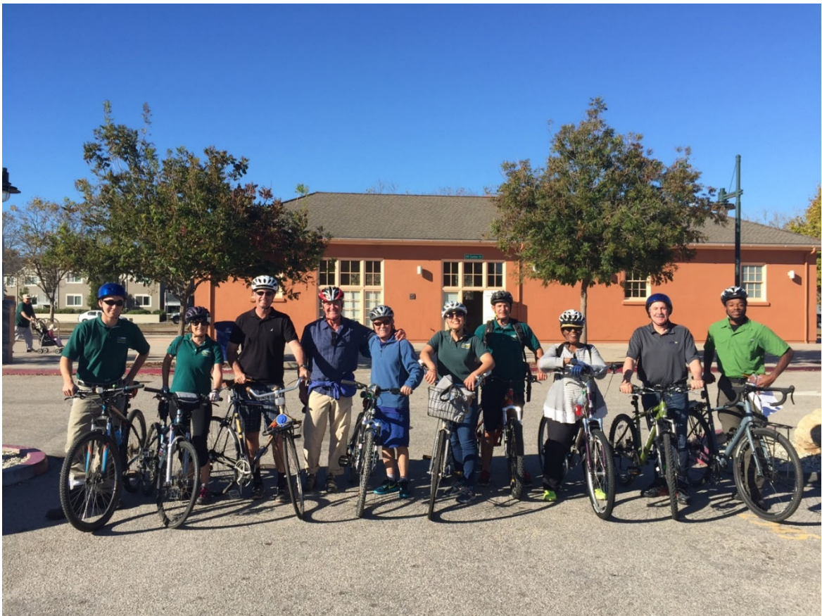
Team TAMC rides bikes

The Transportation Agency for Monterey County is an Equal Opportunity Employer.